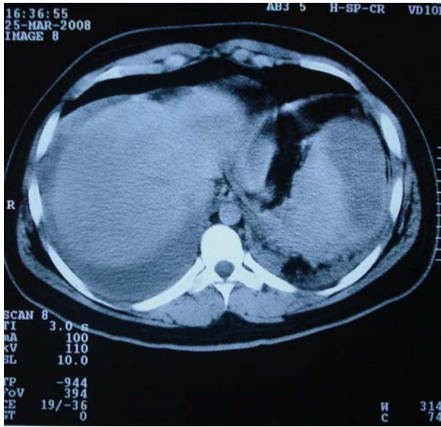
Figure 1. Computed tomography (Patient 2, second day of illness): ascites, hepatic and splenic congestion and a subcapsular spleen hematoma.