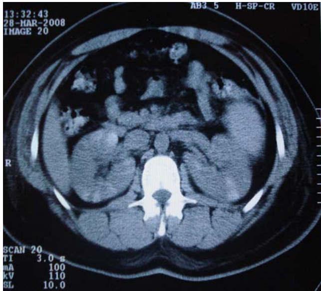
Figure 3. Computed tomography (Patient 2, fourth day of illness): hemorrhagic focus in renal cortical.